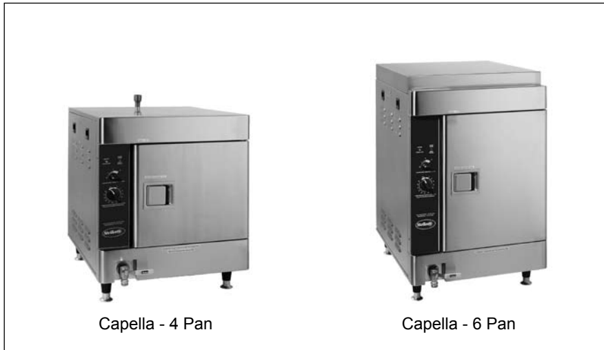
Capella - 4 Pan